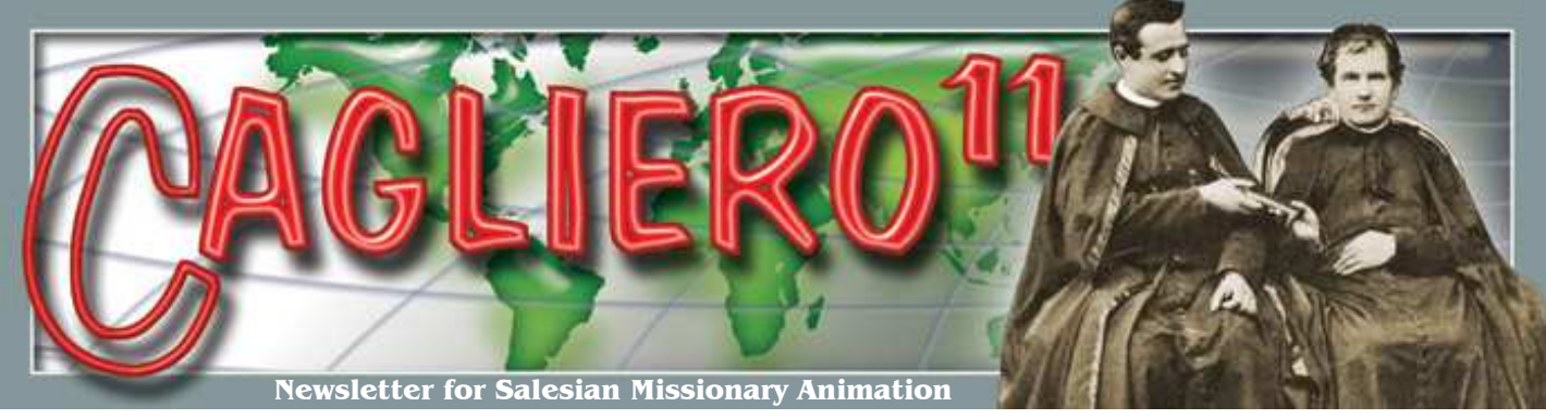
A Publication of the Mission Department for the Salesian Communities and Friends of the Salesian Mission